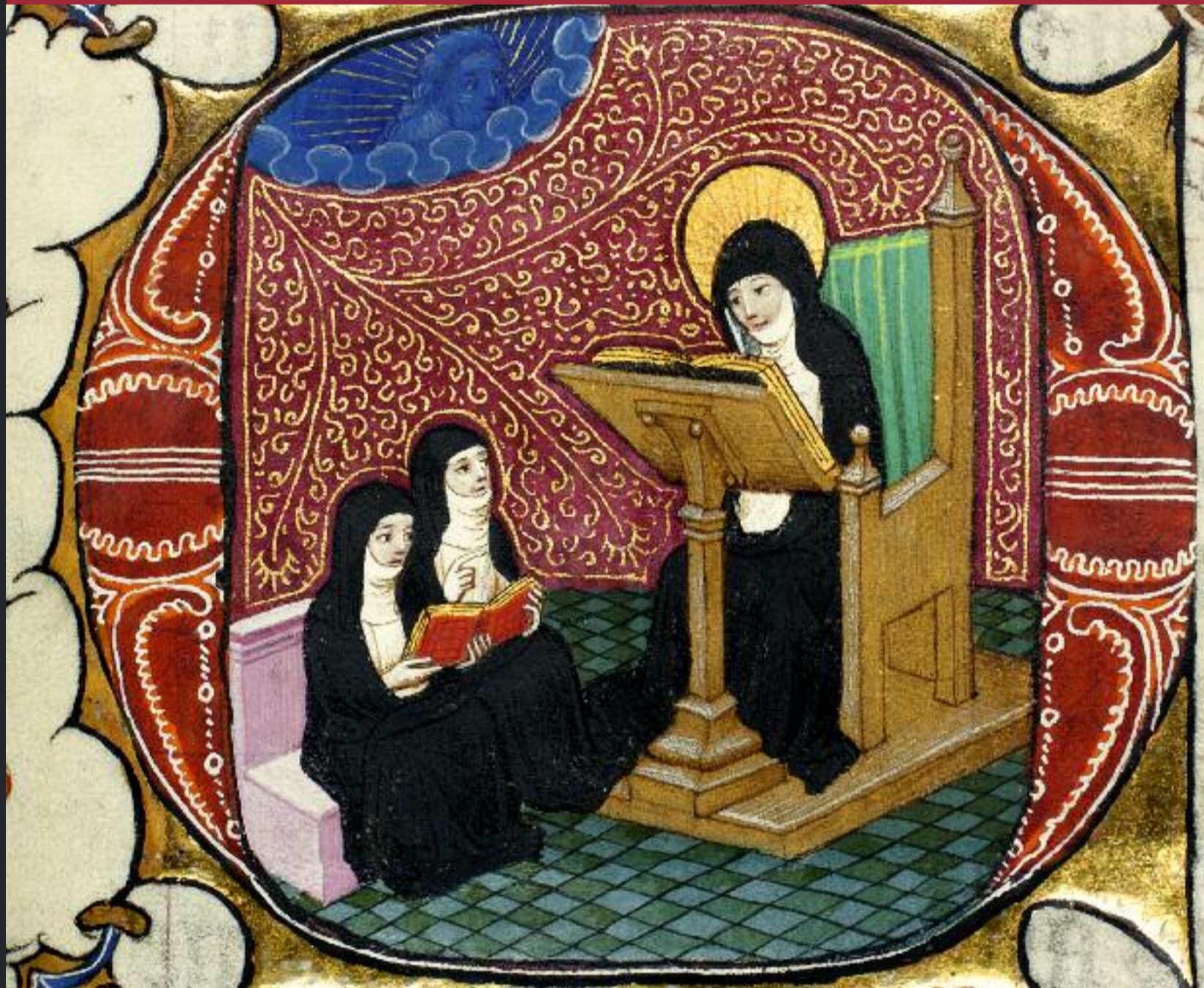
Detail of Folio 61r, The Burnet Psalter (MS 25), University of Aberdeen

An international and inter-disciplinary conference