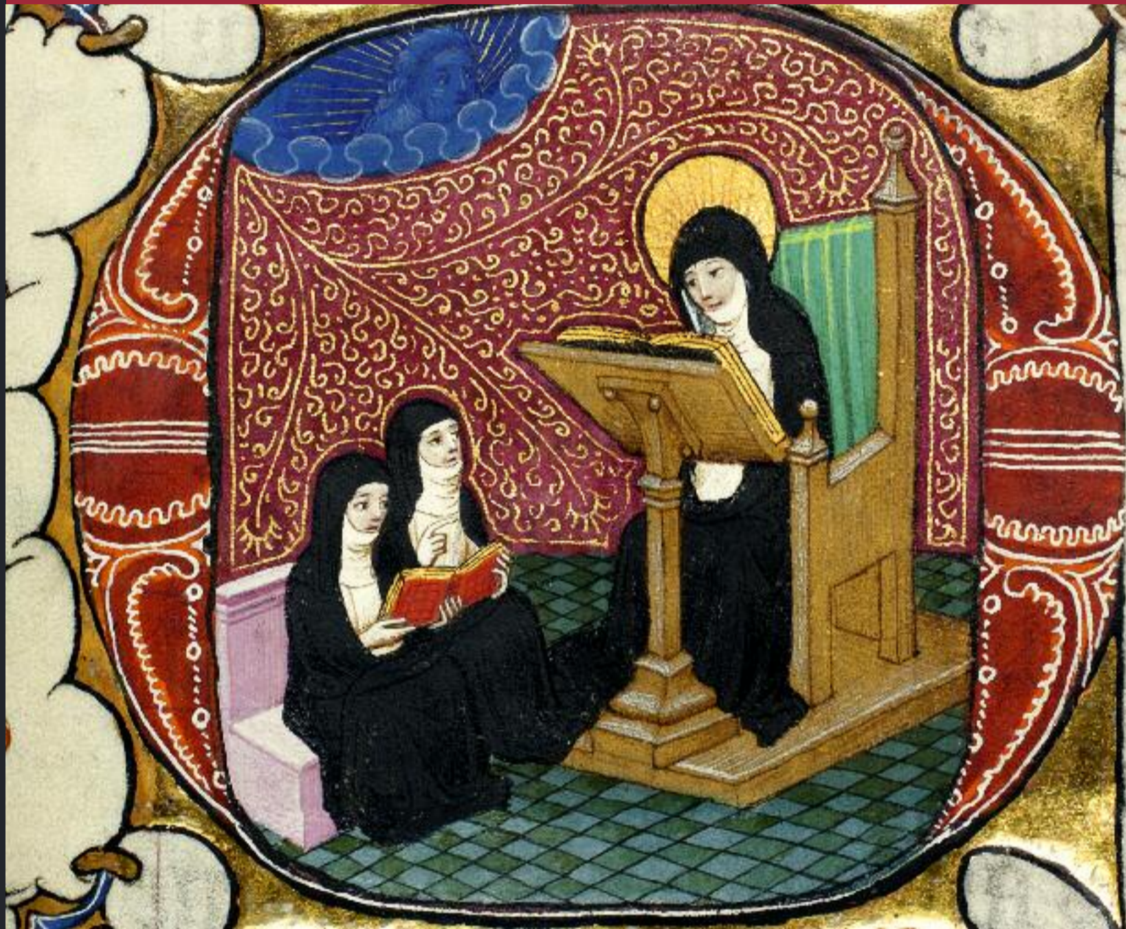
Detail of Folio 61r, The Burnet Psalter (MS 25), University of Aberdeen

An international and inter-disciplinary conference